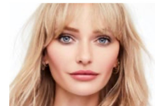
Model has deep-set eyes and square-shaped face.

Want a simple trick for a slimmer-looking nose? Brush highlighter down the bridge of your nose, and apply contour on either side for dimension. Easy as that!